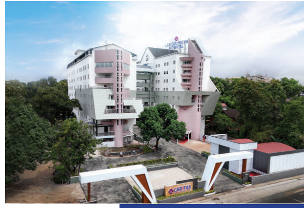
Caritas Matha Hospital, M.C Road, Thellakom, Kottayam