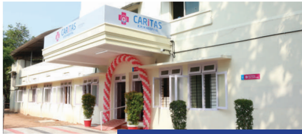
Caritas KMM Hospital, Puthenangady, Kottayam

To make its expert care more accessible for people, Caritas Hospital & Institute of Health Sciences undertakes hospitals and clinics and upgrades them as its polyclinics to provide superior services under its banner.