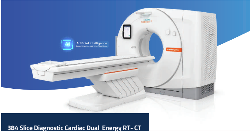
384 Slice Diagnostic Cardiac Dual Energy RT- CT