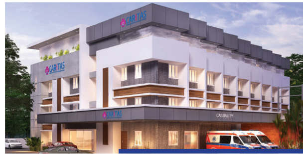
Caritas Family Hospital, Kalathipady, Kottayam